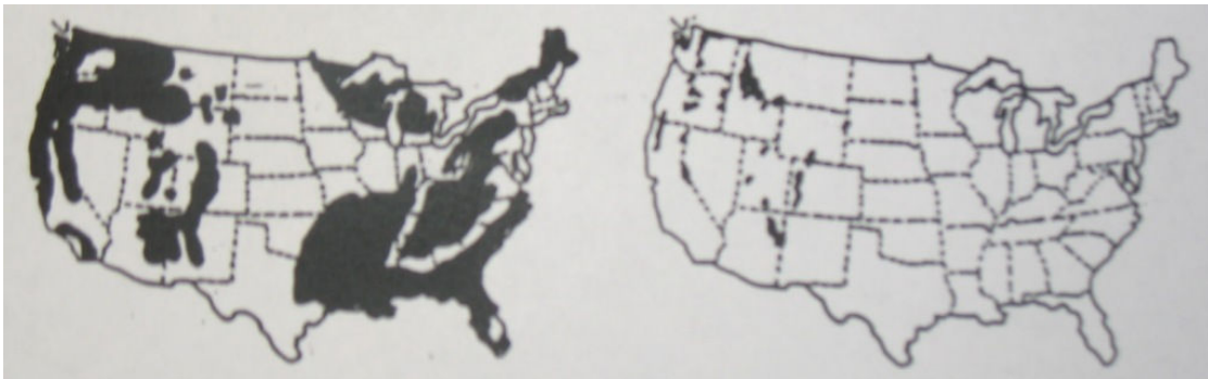
Virgin Forest, 1850

The author of the study pointed out that over 90 percent of the original virgin forest has already been cut down. Much of the endangered wildlife that is left is now crowded into the last 10 percent of what we call Old Growth forest (see maps). If we cut that down, they will have no place else to go. The study concluded that the reason the bug population was exploding was because the wildlife that used to keep the bugs in check including birds, such as pileated woodpeckers, marbled murrelets and spotted owls were on the verge of extinction due to the loss of their homes.