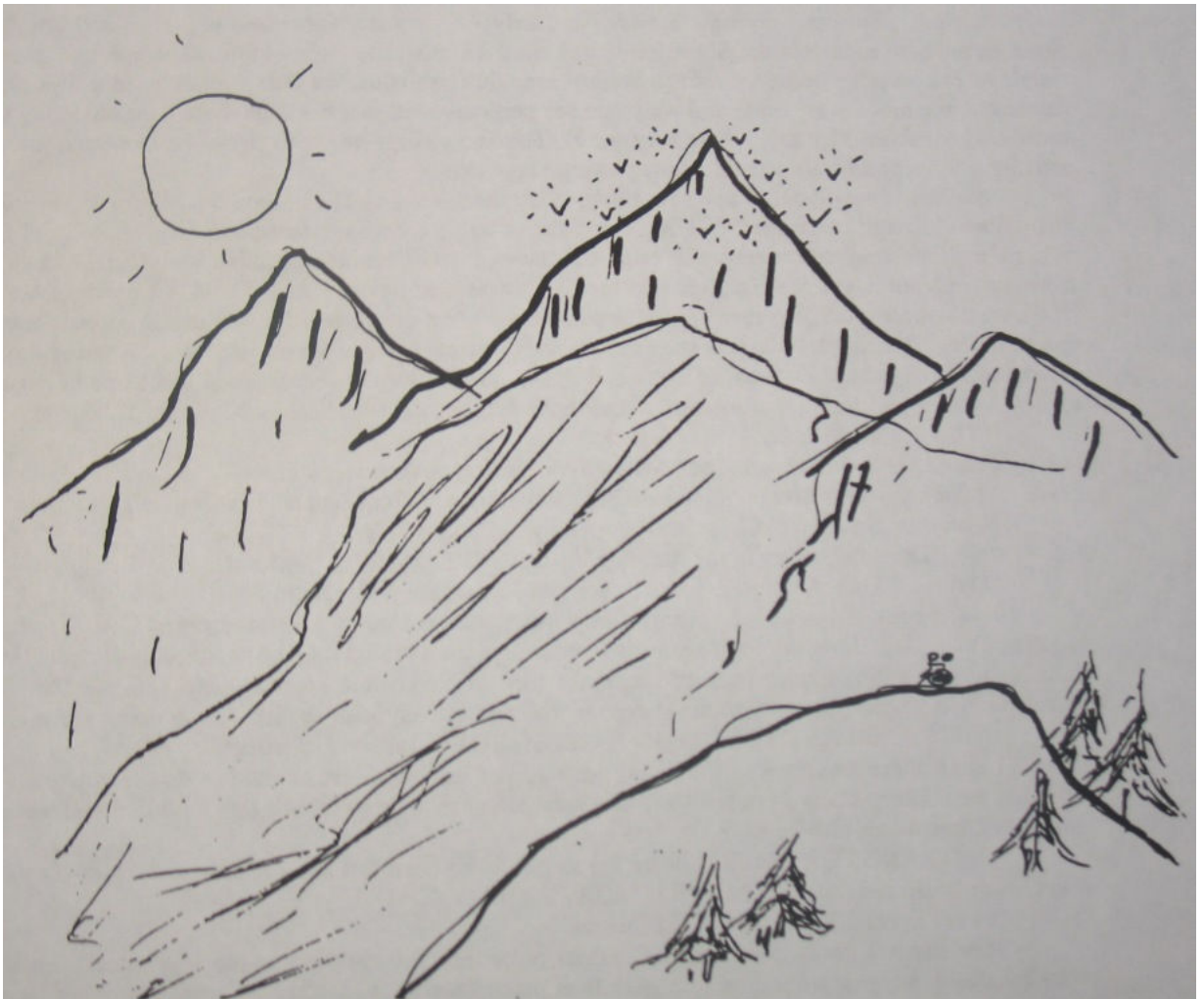
Two Bird Watchers Sitting in the Moonlight

There we were ... two people sitting on a large flat rock at the top of a hill ... in the moonlight ... arm in arm ... watching the Snow Birds circle their mountain. As we sat on that rock, I heard Chris whisper, "There's no birds like Snow Birds."