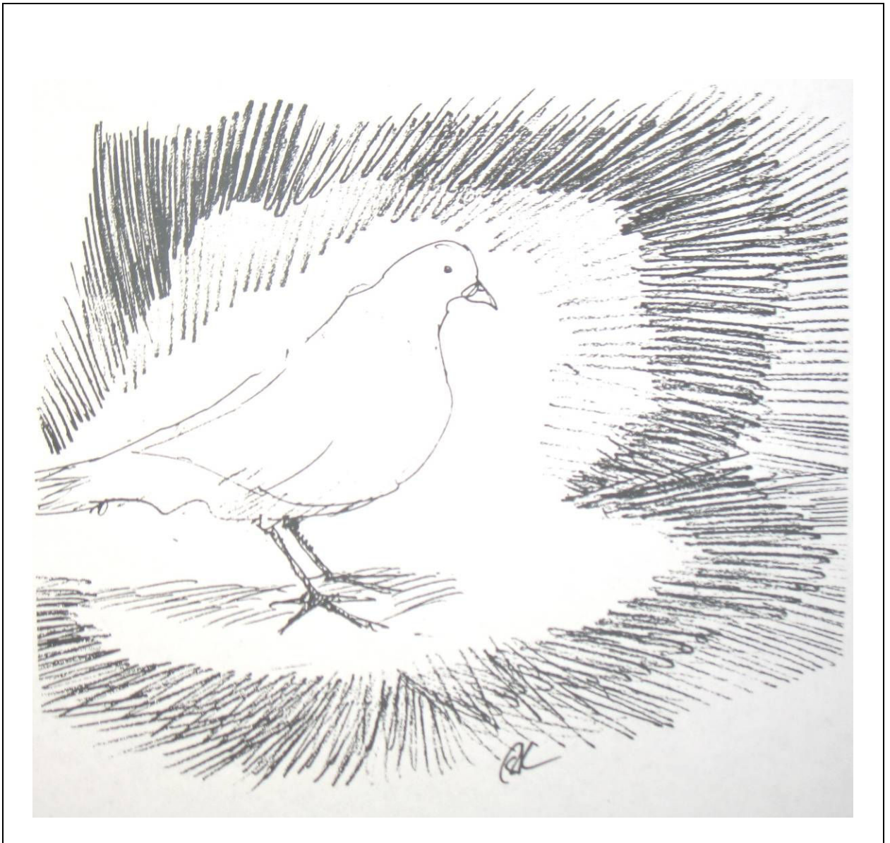
A Glowing Snow Bird

The papers the next day carried the headlines, "Congress Passes Snow Bird Protection Act."